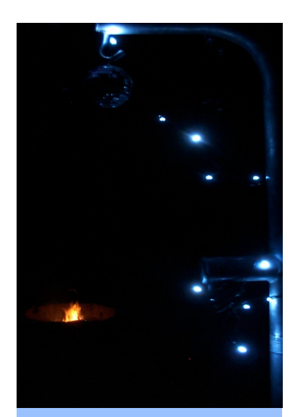
Arcadia's "Pan at the Disco" lights and disco ball at night.

Pan at the Disco featured disco, pop, and dance music around a Pagan fire and dance circle.